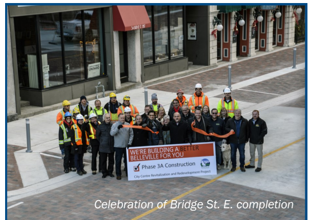
Celebration of Bridge St. E. completion