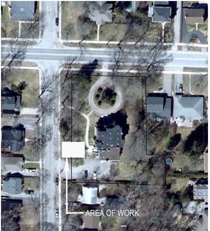
0 SITE KEY PLAN S1.1 N.T.S.